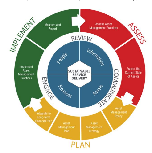
Figure 1: There are strong synergies between asset management processes and the management of natural capital.

However, the apparent synergies between asset management processes and the measurement and management of natural assets may change this. It turns out that standard asset management processes (see Figure 1) lend themselves remarkably well to the measurement and management of natural assets, which makes it practical for municipalities to use the approach.