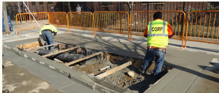
CONTRACTORS FINISH A CONCRETE EDGE AND REPLACE THE SIDEWALK AROUND A NEW RAIN GARDEN

To report a maintenance issue, please call 311 or visit www.nyc.gov/311