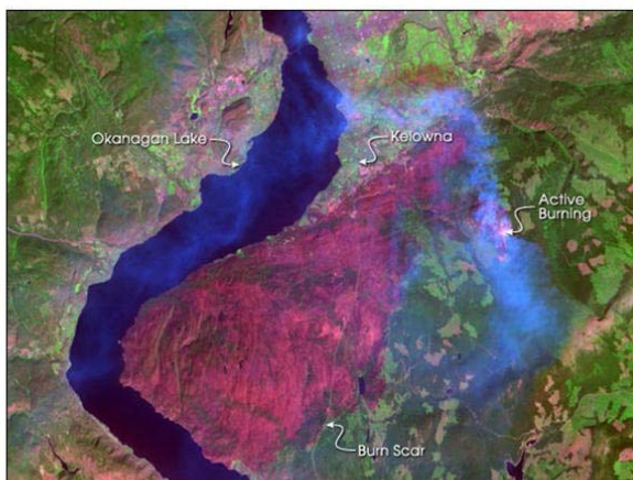
Satellite imagery of forest fires in the Okanagan Basin

Drought, forest fires and floods in 2003 created a ‘teachable year’ for change