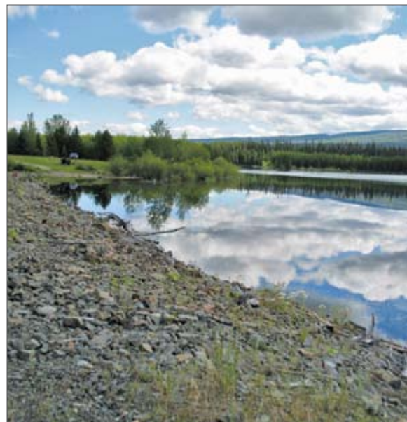
Connie Kruger – Grizzly Dam

Continue working with Interior Health to coordinate assessments of common lake intakes. Continue to work with the province to resolve the issues of jurisdictional authority, and source protection plan implementation.