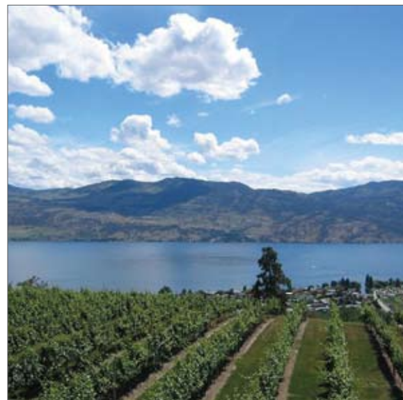
Okanagan Lake Orchard