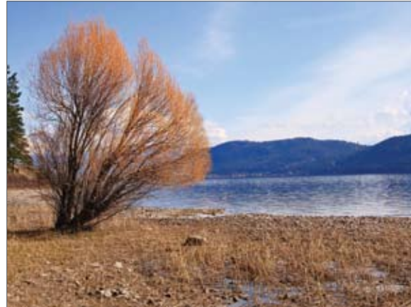
Shawn Fennell - Okanagan Lake

Continue to conduct technical studies that will support the development of a water management plan if the OBWB decides to go that route in the future.