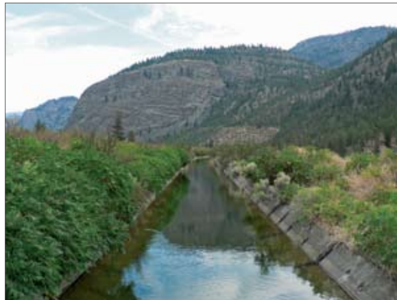
Oliver Irrigation Canal

Consult with the agriculture industry and other stakeholders to determine the feasibility and scope of a reserve. Continue to support scientific studies that contribute to this action.