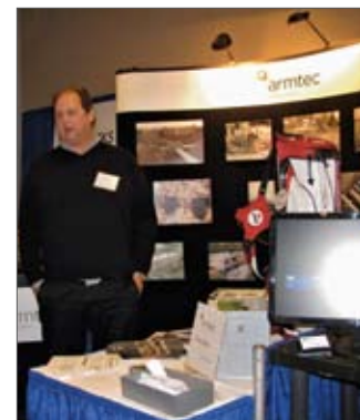
Rain to Resource