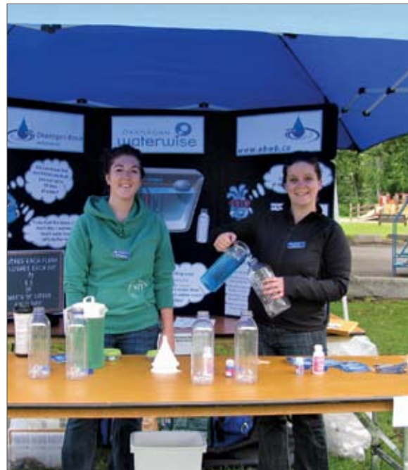
Mayor's Expo with WaterWise

Continue discussions with the Ministry of Environment to determine appropriate funding mechanisms to support water governance.