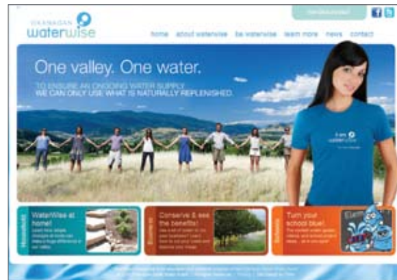
Okanagan WaterWise screenshot

Review the Columbia Basin Trust's plan when it is released. Continue using Okanagan WaterWise to build partnerships that will provide the foundation for a regional water conservation strategy.