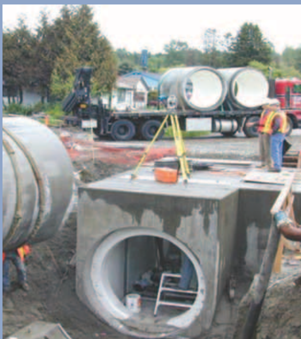
Installing Metro Vancouver trunk sewers, South Surrey.