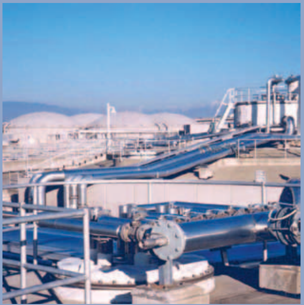
Annacis Island wastewater treatment plant provides treatment for over 1,000,000 people.

Metro Vancouver will increase enforcement of the Sewer Use Bylaw, improve source control tools and update outreach and education programs. Metro Vancouver and municipal actions will jointly seek to reduce groundwater and rainwater entering sanitary sewers over the long-term.