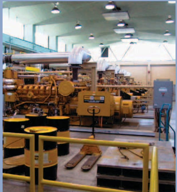
Biogas produced from wastewater supplies heat and power to the Iona Island wastewater treatment plant.

A major challenge for Metro Vancouver and its members will be to adapt the legacy sewerage and stormwater infrastructure of the 20th century to a more sustainable, integrated 21st century system focussed on integrated resource recovery. This will involve embracing new technologies and reshaping communities and their infrastructure so that the resources and energy recovered can be used efficiently and effectively: integrating a new kind of liquid waste infrastructure with building design, community and nature. This involves managing liquid wastes as a resource, minimizing discharges, minimizing financial risks, and maximizing the quality of discharges.