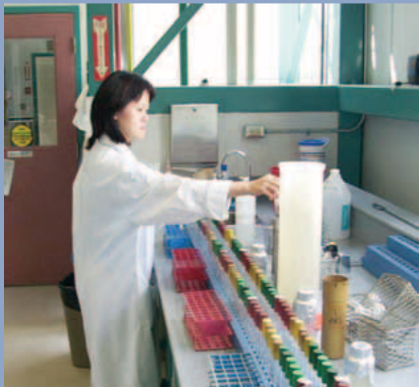
Monitoring at the Iona Island wastewater treatment plant laboratory.

3.3.8 Maintain and, if necessary, expand the existing municipal sewer flow and sewer level monitoring network. Ongoing