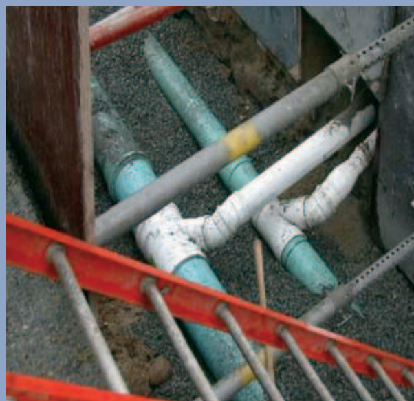
Private sewers connect homes and businesses to the municipal-regional sewer network.

plants, and develop associated target allowances for municipal sewer catchments associated with a 1:5 year return frequency storm event for sanitary sewers to a level that ensures environmental and economic sustainability. 2013