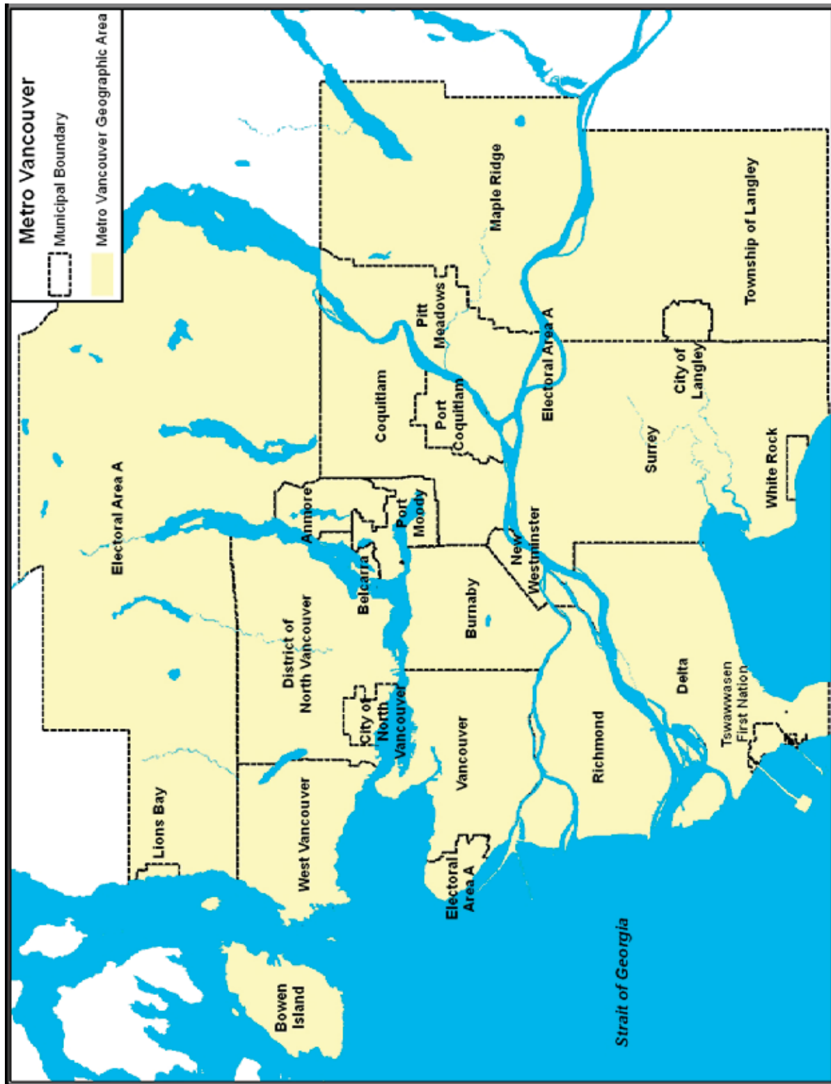
Figure 1 Metro Vancouver Member Municipalities and Electoral Area A